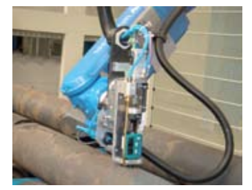
Equotip Piccolo 2

Equotip Piccolo 2 and Bambino 2 are supplied with a D impact device. It can be interchanged with an optional DL impact device, which is useful for measurements in restricted areas.