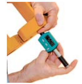
Equotip Bambino 2